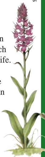
southern marsh orchid

This trail passes over rich dune grassland with plants such as pyramidal and bee orchids. It then turns past the pond platform which allows a closer look at the pond life. Look out for leaches and water scorpions. As the trail circuits the marsh, other wet loving plants can be seen, like marsh helleborine and southern marsh orchids.