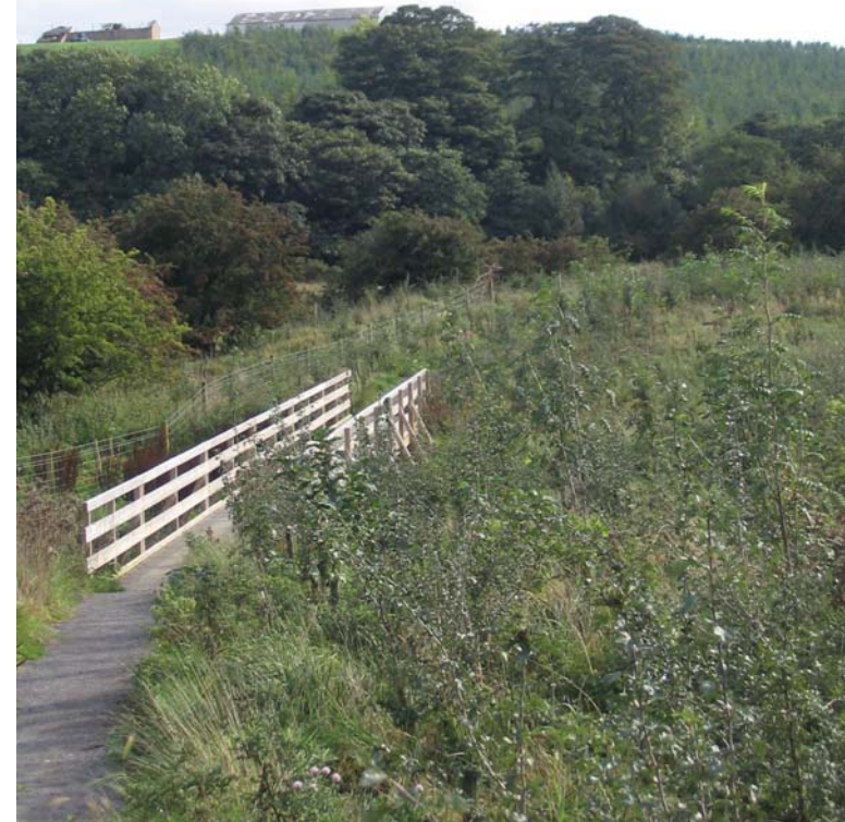
A view of the Spring Gardens nature trail